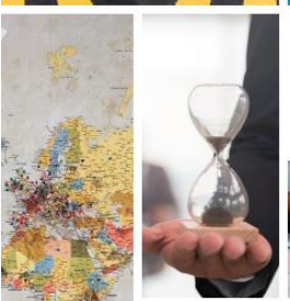
LABOUR MOBILITY SCHEME GUIDE