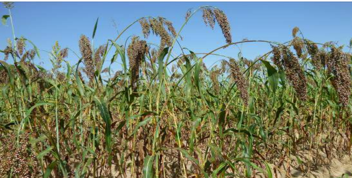
CSM 631 - DIAKUMBI