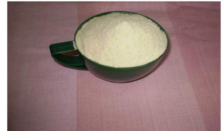
RIAL (Rice Peanut Milk)