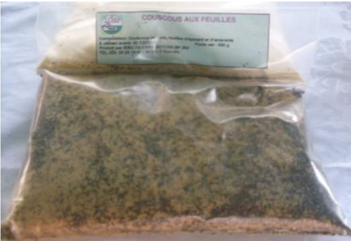
Couscous of millet with leaves